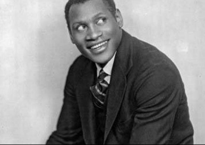
PAUL ROBESON · 1898-1976